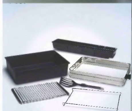
Silex Kitchen Genius Accessories