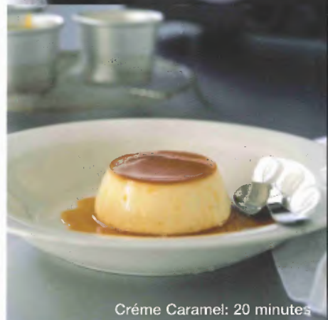
Crème Caramel: 20 minutes