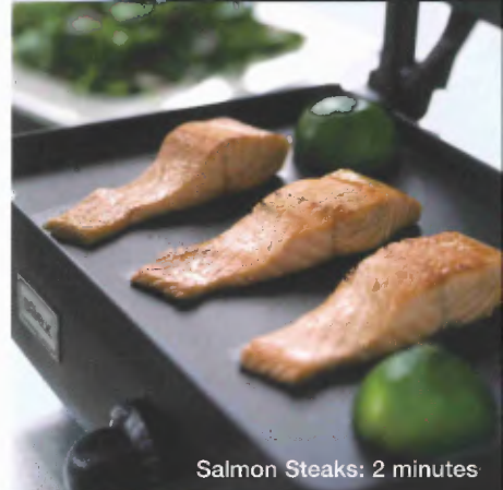
Salmon Steaks: 2 minutes